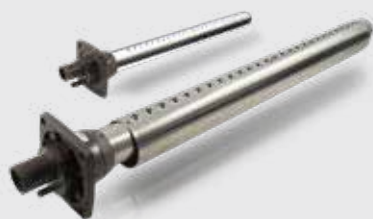
Linear steam distributors